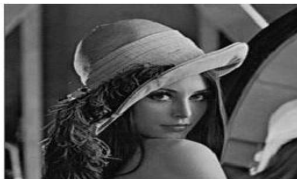
Fig.3: Grey scale

It is additionally named as an intensity, gray scale, or grey level image. Array of sophistication uint8, uint16, int16, single, or double whose component values specify intensity values. For single or double arrays, values vary from [0, 1] . For uint8, values vary from [0, 255] . For uint16, values vary from [0, 65535] . For int16, values vary from [-32768, 32767] . Image construction mistreatment detector and completely different image acquisition instrumentation denote the brightness or intensity I of the sunshine of an image as 2 dimensional continuous operate F(x, y) wherever (x, y) represents the abstraction coordinates once exclusively the brightness of sunshine is taken into account. generally three-dimensional abstraction coordinate are utilised. Image involving solely intensity are called grey scale pictures.