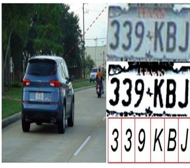
Fig.1: Vehicle Plate Recognition