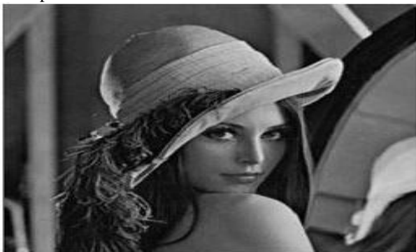
Fig.3: Grey scale

It is additionally named as an intensity, gray scale, or grey level image. Array of sophistication uint8, uint16, int16, single, or double whose component values specify intensity values. For single or double arrays, values vary from [0, 1]. For uint8, values vary from [0,255]. For uint16, values vary from [0, 65535]. For int16, values vary from [-32768, 32767]. Image construction mistreatment detector and completely different image acquisition instrumentation denote the brightness or intensity I of the sunshine of an image as 2 dimensional continuous operate F(x, y) wherever (x, y) represents the abstraction coordinates once exclusively the brightness of sunshine is taken into account. generally three-dimensional abstraction coordinate are utilised. Image involving solely intensity are called grey scale pictures.