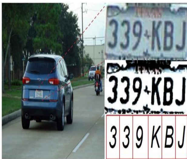
Fig.1: Vehicle Plate Recognition