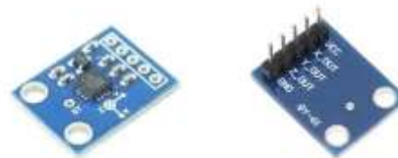
Fig 4.2 ADXL335 Accelerometer

ADXL335 is used as a 3-Axis accelerometer MEMS sensor. The output signal of this sensor is drawn between 1.8 V to 3.6 V for X and Y axis. Static acceleration gravity is measured by tilting the MEMS Sensor. The change of output voltage is depending on the change in the supply voltage. The tilt position of the sensor caused to produce the output signal in order to determine the motion of the wheel chair. This signal is processed by the microcontroller to enable the motion of the wheel chair.