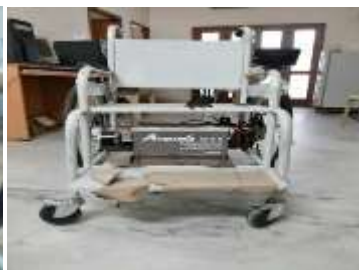
Fig 6.2 Completely Assembled Wheel Chair