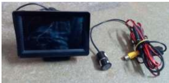
Fig 4.5 Rear View Camera and Display

The rear camera and display are provided for the patient to monitor the rear view of the wheel chair during the backward motion.