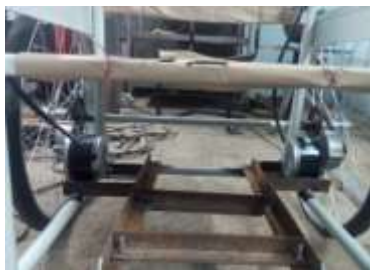
Fig 6.1 Wheel chair Motors Alignment

The movement of the hand is sensed by the MEMS accelerometer sensor and the corresponding signal based on the angle of elevation is sent to the micro controller. The signal is processed in the micro controller and corresponding directions are given to the motors. The developed model had been tested with an increasing load from 50 Kg to 80 Kg.