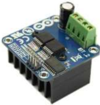
Fig 4.3 IBT-2 Drivers