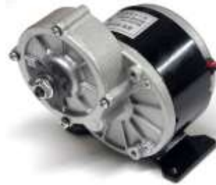
Fig 4.6 MY1016Z2 Motor

Full load current - 13.4 A No-load current - 2.2 A Torque Stall - 240 kgcm Constant torque - 80 kgcm