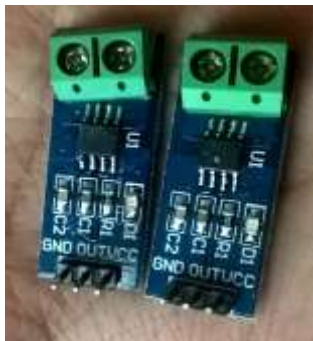
Fig 4.4 ACS712 Current Sensors

The Allegro ACS712 provides economical and precise solutions for AC or DC current sensing in industrial, commercial, and communications systems. This sensor is used for the heavy load detection.