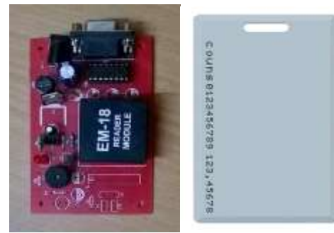
Fig 4.1 EM-18 RFID Reader and Passive Card

The EM-18 RFID Reader module operating at 125 kHz is an inexpensive solution for your RFID based application. The Reader module comes with an on-chip antenna and can be powered up with a 5V power supply. Power-up the module and connect the transmit pin of the module to receive pin of your microcontroller. Show your card within the reading distance and the card number is thrown at the output